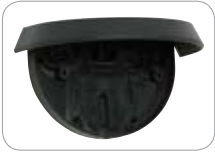
DOMCOVER Combined ceiling mount and weather cover bracket